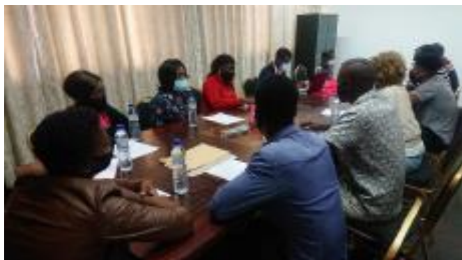
Training of assessment leaders for beneficiary data collection to MSMEs recovery activities, focusing in fishery and poultry sector, in Beira, in September 2021.