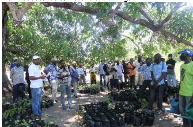
Plant nurseries led by five associations in Tratara, Cabo Delgado, in December 2020. MRF provided cash-for-work, seeds, tools, materials, trainings.