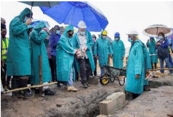
First Stone Ceremony of the Guara Guara Market, during the EU-UNDP mission, in December 2020.