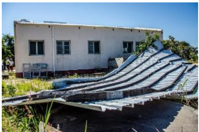
Sengo Health Clinic to be rehabilitated, in September 2021.