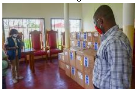
Handover and use of equipment and furniture at the Dondo Municipal Library.

In view to technological modernization, the project also delivered and installed nine computer kits (display, CPU, external HD, accessories), three laptops, three printers, air conditioning and various furniture (tables, chairs and shelves) to the Municipal Library of Dondo. The objective is to offer comprehensive assistance so that it becomes an improved, modern and functional public space, where students and researchers can enjoy it for study and peer learning.