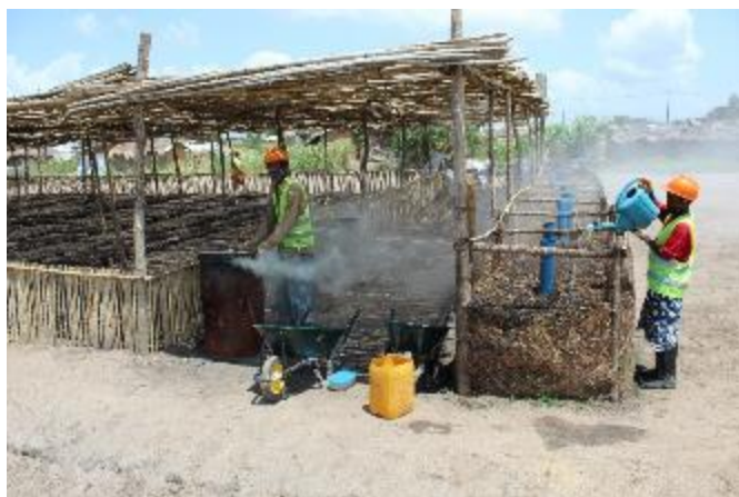
Composting production in Dondo district, in November 2020. MRF provided skills trainings, protective equipments and materials.