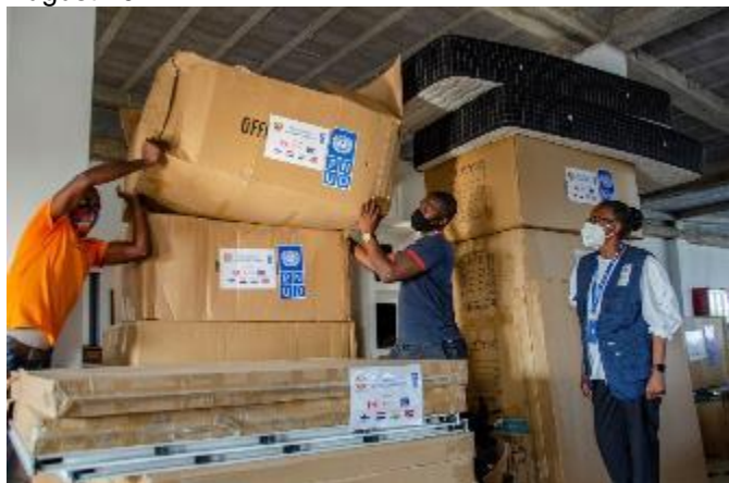
Handover of equipment and furniture to Beira administration to help restore public services, in Beira, in August 2021.