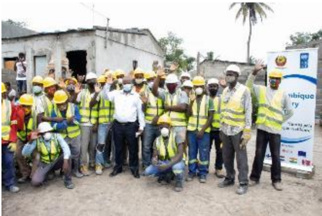
Masons who worked at the housing rehabilitation project in Beira, in December 2020.