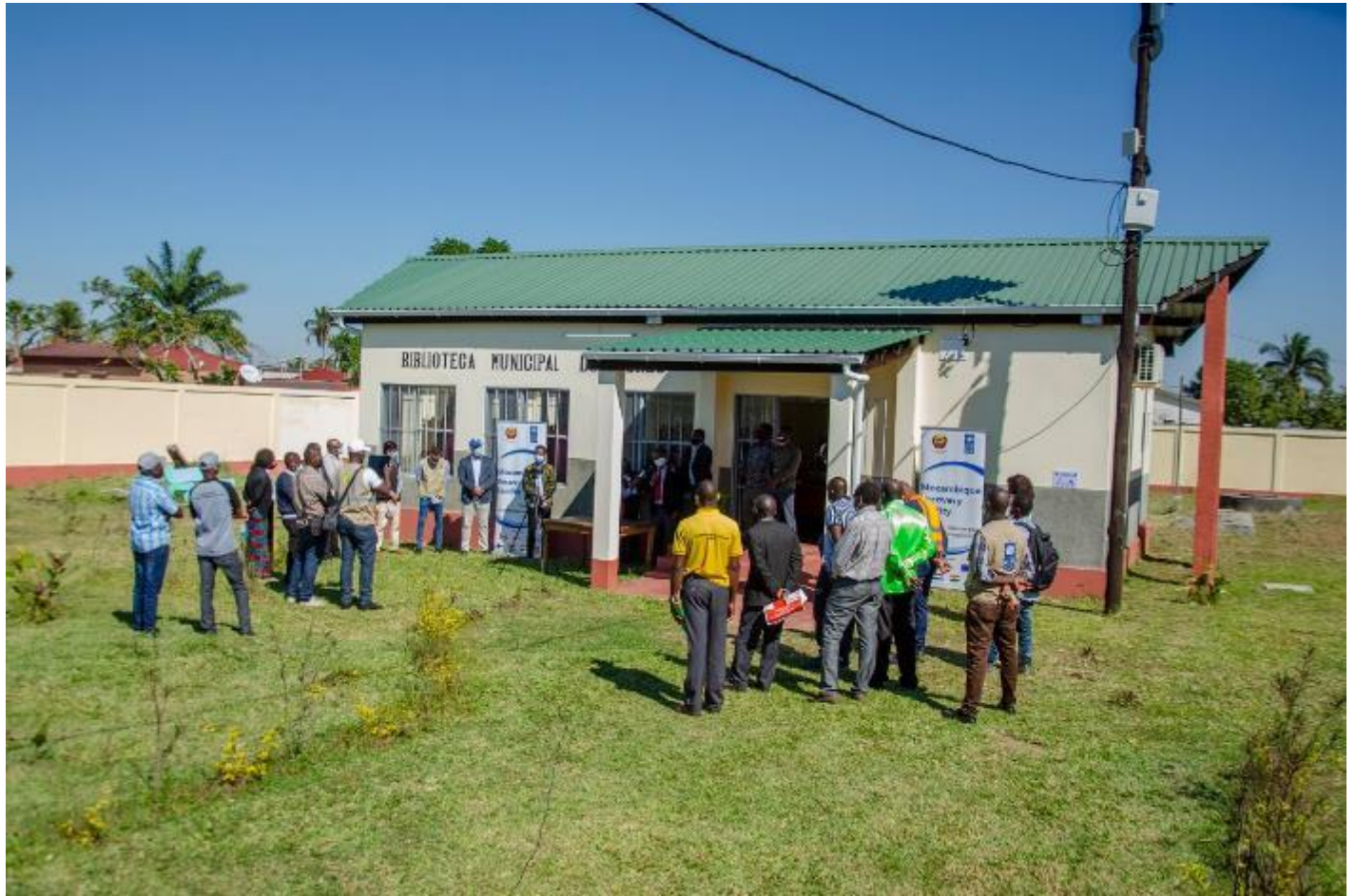
Dondo Municipal Library inaugurated.