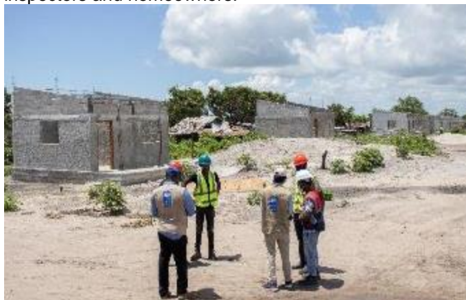
MRF's housing project in Mutua resettlement neighborhood, in February 2021. Risk-informed and resilient construction techniques are incorporated in the building codes and housing standards, to provide training and knowledge sharing among local contractors, building inspectors and homeowners.