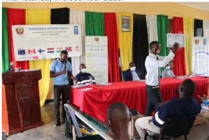
Closing ceremony of vocational trainings to orphan youths in partnership with IFPELAC education center, in Nhamatanda, in December 2020.