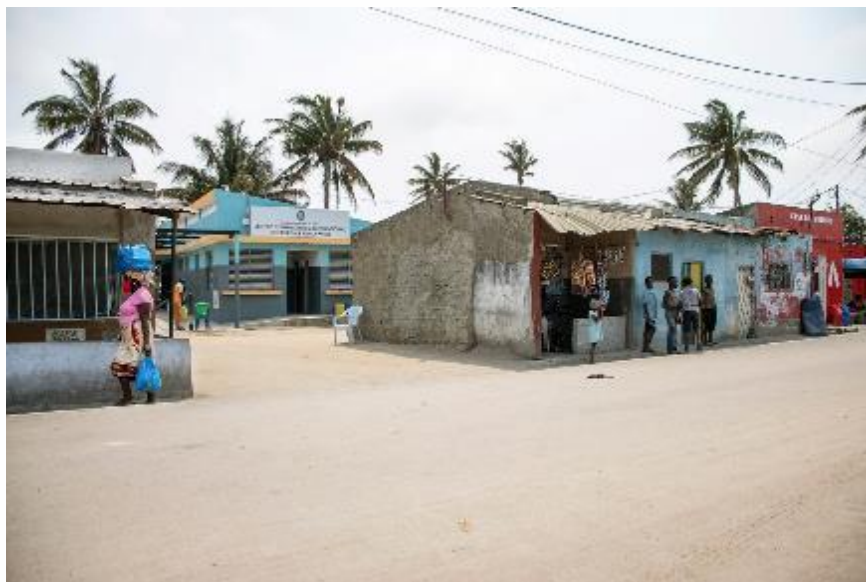
Main access street to the Community Center in Munhava.

In 2016, he was hired as a technician by Beira Municipality to manage the production of the new Multifunctional Community Centre for Renewable Energy in Munhava neighbourhood, the first of its kind in Mozambique, where he has been working ever since.