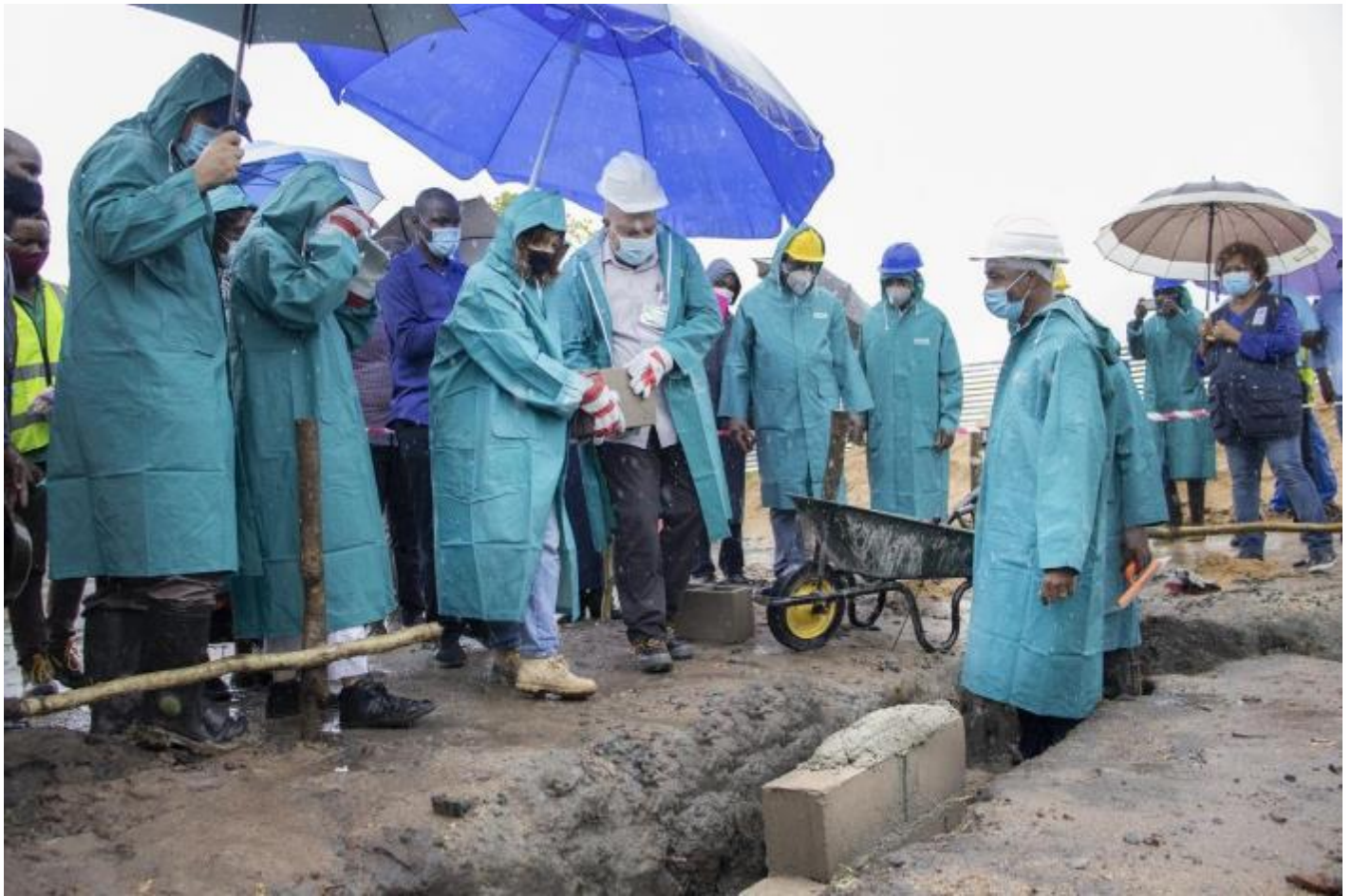
The EU, the Government of Sofala and UNDP held the first stone ceremony of the Guara Guara Market, Buzi District - the first of its kind in the resettlement neighborhood - directly benefiting 1,100 people through the UNDP Recovery Facility to help restore the economic services after the 2019 cyclone and floods.

withstand the multiple shocks, in a time when cooperation for development, such as this one between UNDP and the European Union, has become even more necessary”.