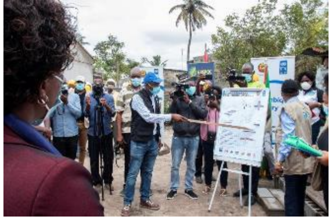
Ceremony to launch the housing rehabilitation project during the EU-UNDP mission, in December 2020, in Beira.