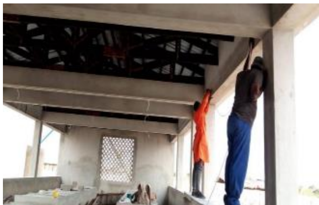
Electrical installation in the Mutua Market, in September 2021.