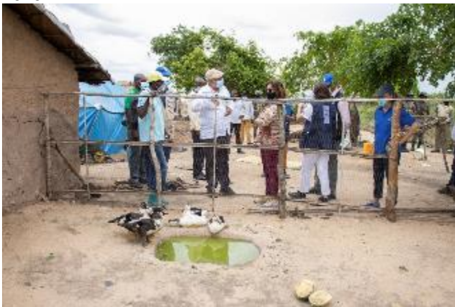
Visit to poultry farming in Mutua resettlement neighborhood, during the EU-UNDP mission, in December 2020.