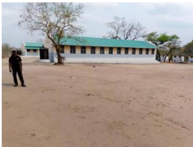
Chiacuacha Primary School, in September 2021.