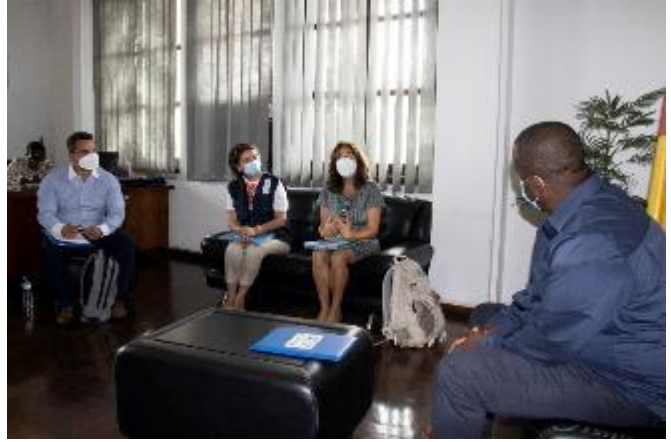
Courtesy meeting with the late Mayor of Beira during the EU-UNDP mission, in December 2020, in Beira.