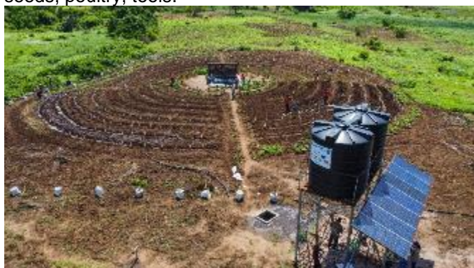
Agriculture production led by an association counting on solar-powered water system, in Chibabava district. MRF provided the irrigation equipments, trainings, materials, seeds, poultry, tools.