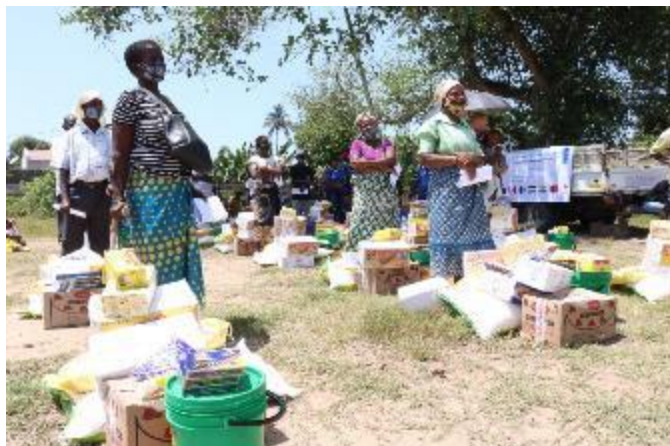
Beneficiaries receive start-up kits to open their small businesses, in Beira city, in October 2020.