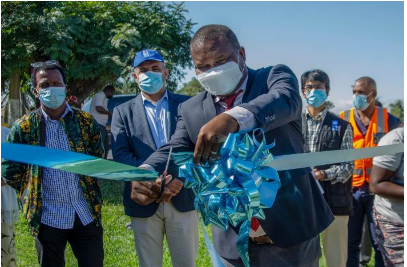
Library reopening ceremony.

The president of the Municipal Council of Dondo, HE Manuel Virade Chaparica, stressed that “a profound rehabilitation of the public library was made; this is an important infrastructure for the students’ learning. (...) We need percipient people for this library to last for a long time. I am assigning the Education Department to select the best employees that we have in the Municipality of Dondo so that they can fill this role carefully”.