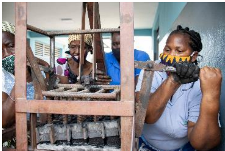
A group of women, who were trained by Leonel, work on the pressing stage of biological charcoal production. In total, 50 women were trained in the Munhava Community Center.

Through these emergency works carried out by the Government of Mozambique and UN agencies, a significant portion of the cyclone's wreckage was collected and, in the end, processed at the Community Centre for the production of organic charcoal, combining rapid recovery in the scope of humanitarian assistance with the creation of a value chain based on sustainable energy and the resilient reconstruction of Beira city.