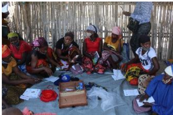
Women's savings group created with support of MRF training and cash-for-work in Pemba, Cabo Delgado.