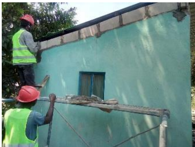
House under rehabilitation in Mandruzi, in September 2021.