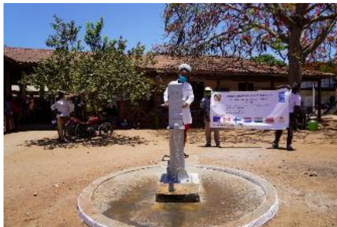
Handpump water point rehabilitated through MRF in Pemba city, Cabo Delgado, in November 2020.