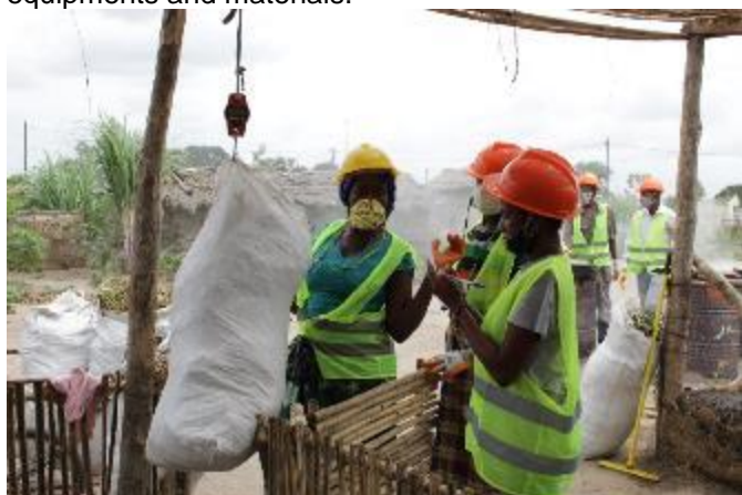
Recycling process in waste management center in Mandruzi resettlement neighborhood, Dondo, in October 2020. MRF provided skills trainings, protective equipments and materials.