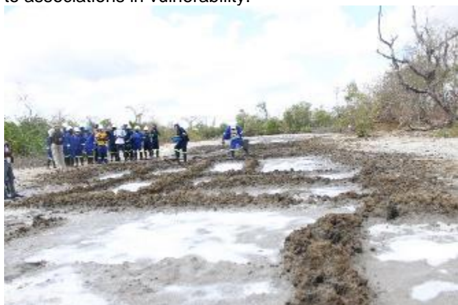
Salt production in Metuge, Cabo Delgado, in December 2021. MRF provided equipments, materials and trainings to associations in vulnerability.