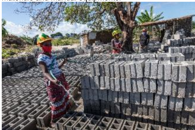
Brick production in Mandruzi resettlement neighborhood, Dondo, in May 2021. MRF provided cash-for-work, materials and manual equipments.