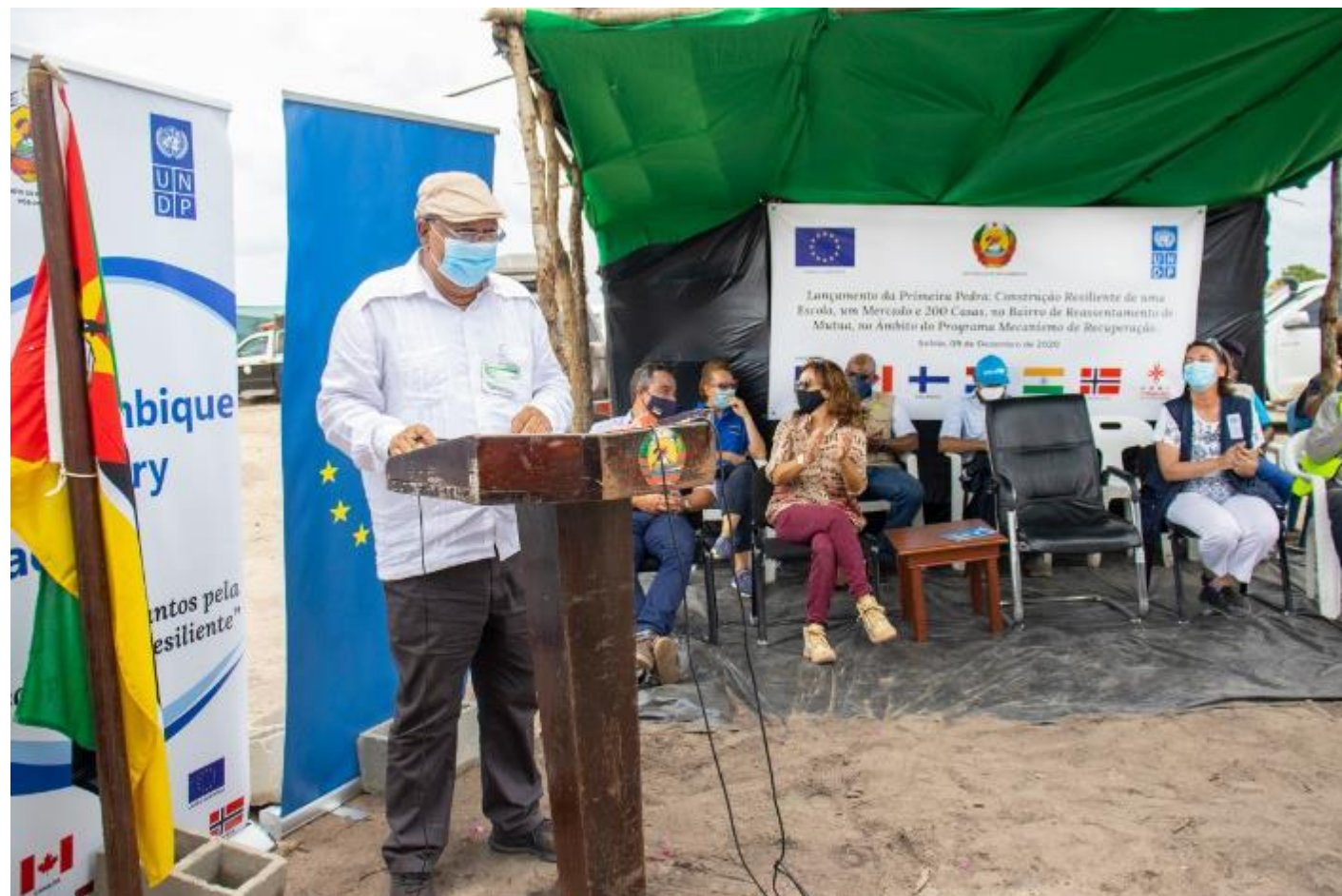
Provincial Governor announces the construction of 200 houses, a school and a market through the EU-UNDP recovery project in Sofala.

Published on 10 December 2020 at https://www.mz.undp.org/content/mozambique/en/home/presscenter/pressreleases/EU_UNDP_visit_post_cyclone_resilience_recovery_activities.html