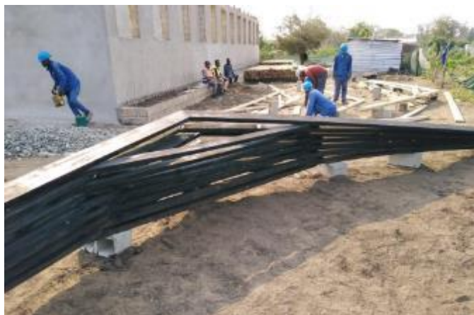
Construction of the Muconjo Primary School in progress, in September 2021.