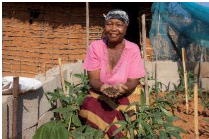
Home garden in Mahate, Cabo Delgado, in November 2020. MRF provided trainings, seeds and materials.