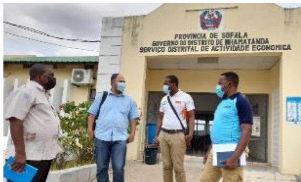
Meeting with Nhamatanda district government for the continued integrated assistance to beneficiaries engaged in the first year of MRF's interventions.