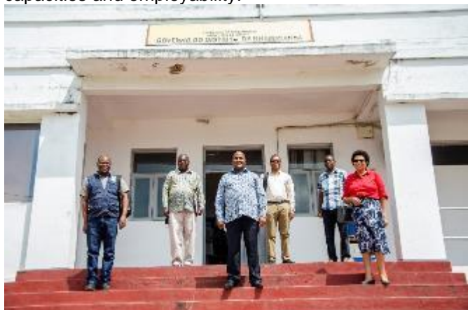
Meeting with Nhamatanda local government for MSMEs recovery and reactivation to strengthen institutional capacities and employability.