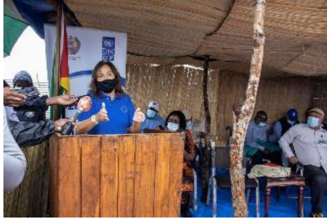
EU Head of Cooperation during the First Stone Ceremony of the Guara Guara Market in December 2020.