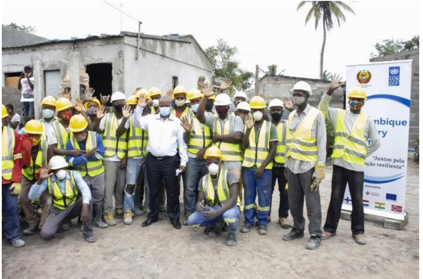
Local masons working on the UNDP Recovery Facility housing rehabilitation project in the city of Beira, Mozambique on 07 December 2020. 320 houses damaged by the cyclone in Beira are being restored using resilient construction techniques.