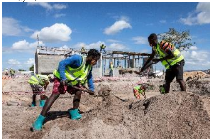
Temporary employment through cash-for-work in Market construction, in Mutua resettlement neighborhood, Dondo, in May 2021.