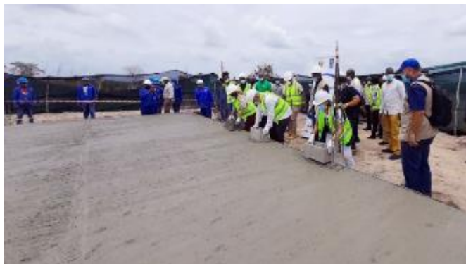
First Stone Ceremony of the Mutua Market, during the EU-UNDP mission, in December 2020.