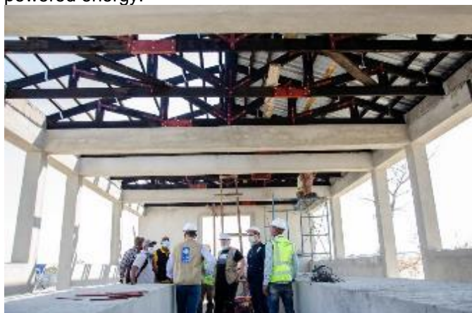
Market construction in Mutua resettlement neighborhood, in August 2021. The project includes public restrooms, water harvesting system, access ramps and solar-powered energy.