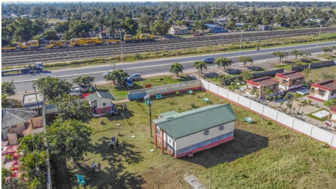
Dondo Municipal Library after rehabilitation.

UNDP Recovery Facility rehabilitated the Dondo Municipal Library following cyclone destruction, and modernized it technologically with new equipments.