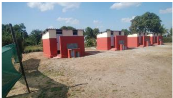
Chipinde Primary School in September 2021.