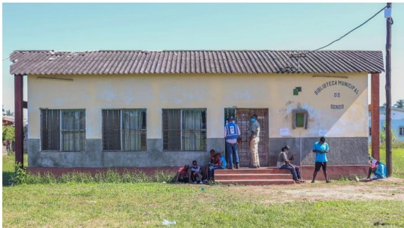
In 2020, before the start of the reconstruction and already during COVID-19 pandemic, the building was inoperative. Still, students flocked outside the premises to use the free Wi-Fi internet service.

“COVID-19 brought us a new challenge. A large number of students began to stay outside the closed library, to browse the internet that is installed and which, in a way, helped them to continue their studies from the online classes they were submitted to, as they were unable to afford it at home. In this sense, the library plays a decisive role in the culture and learning of these individuals. It is an added value now that the conditions were also created to comply with the sanitary protocol to tackle COVID-19. The revitalized garden is secured with fence walls and is a pleasant space outdoors, where they can sit and comply with the social distancing”, concluded Bonde.