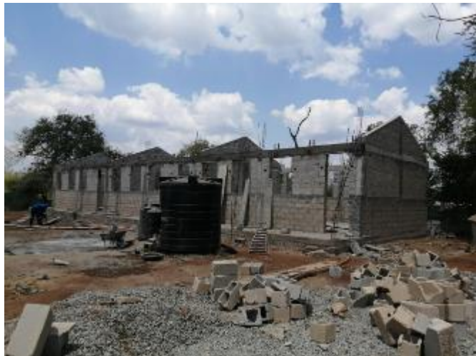
Girome Primary School in progress, in September 2021.