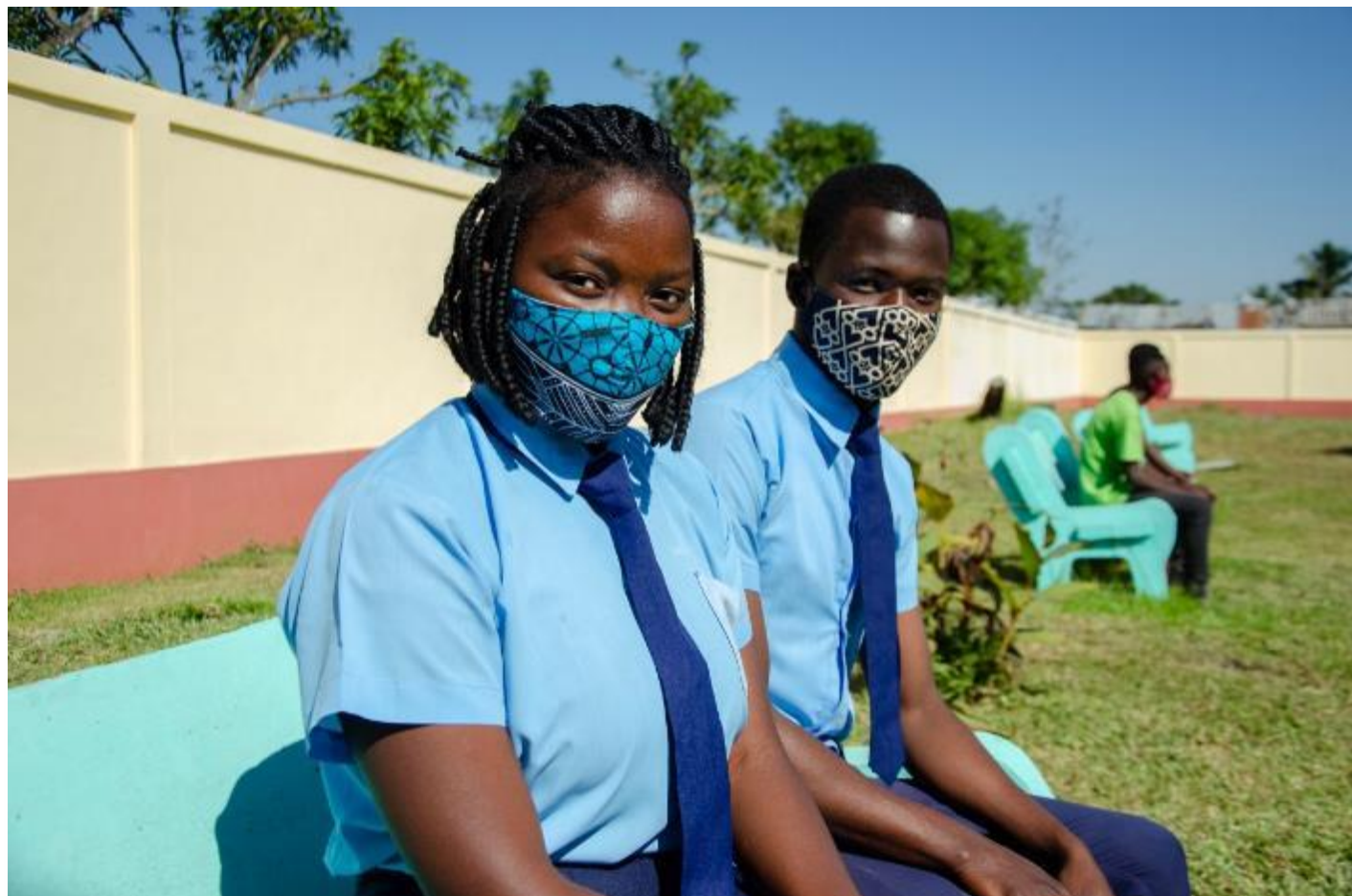
Students at the yard in Dondo Municipal Library.

created so that the child, the youths, the student can feel comfortable and learn all kinds of subjects. I believe that this library will bring many users not only from the city of Dondo, but also from Beira”, he concluded.