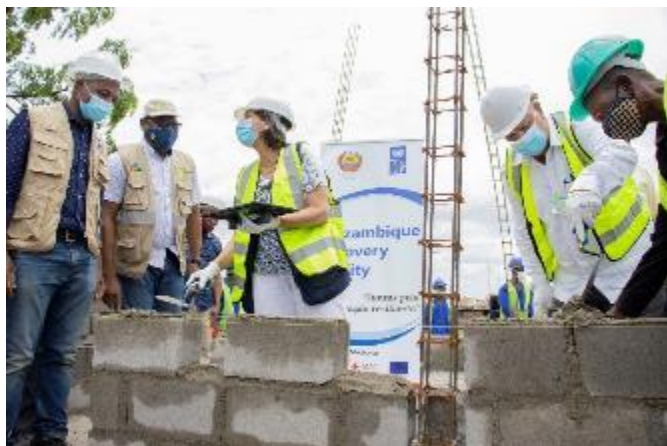
First Stone Ceremony of the housing project, during the EU-UNDP mission, in December 2020.