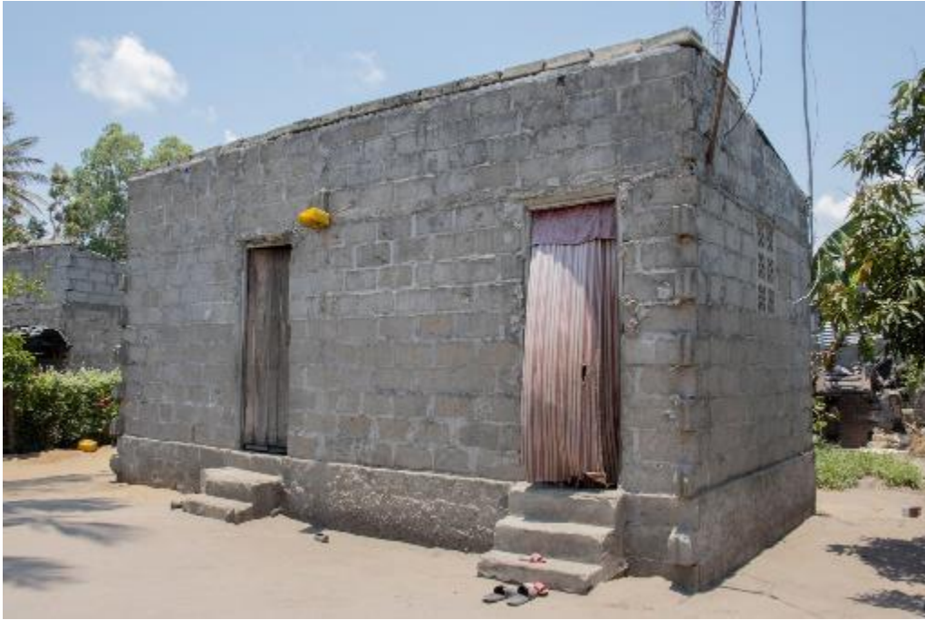
Amélia's house before the reconstruction. In addition to the damaged roof, the building had no windows and doors, which hampered the family's salubrity and safety.

In Mozambique, the impact of the Cyclone caused loss of life, widespread destruction of infrastructure and shelters, as well as the interruption of essential services, markets and livelihoods. The effects of the disaster were even more impactful due to the pre-existing vulnerabilities that characterize the most affected areas. Furthermore, Mozambique is one of the African countries most prone to climate-related disasters and is one of the ten countries in the world with the lowest Human Development Index (2020) .