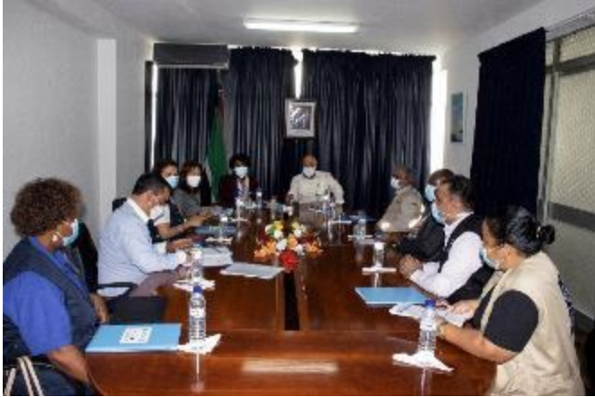
Courtesy meeting with the State Secretary and the Governor of Sofala during the EU-UNDP mission, in December 2020, in Beira.