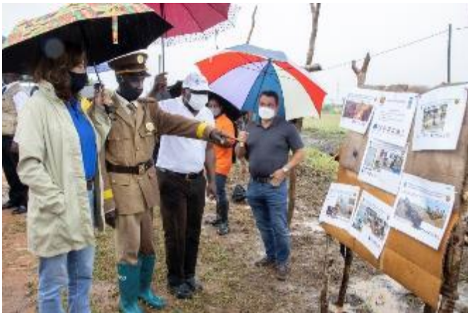
Presentation of livelihood recovery activities supported by MRF in Buzi, during the EU-UNDP mission, in December 2020.