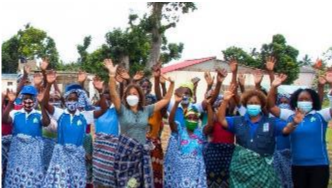
Meeting with women participating in VSLAs during the EU-UNDP mission, in December 2020, in Beira.