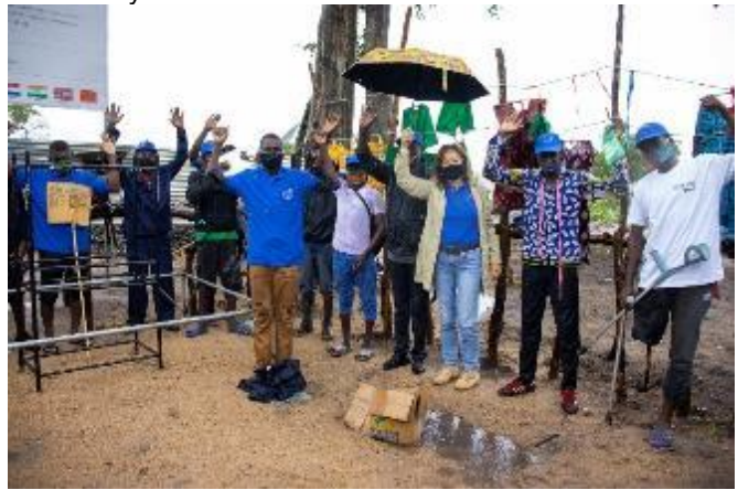
Beneficiaries of livelihood recovery activities – electricians, mechanics, other areas – at the First Stone Ceremony of the Guara Guara Market in December 2020.